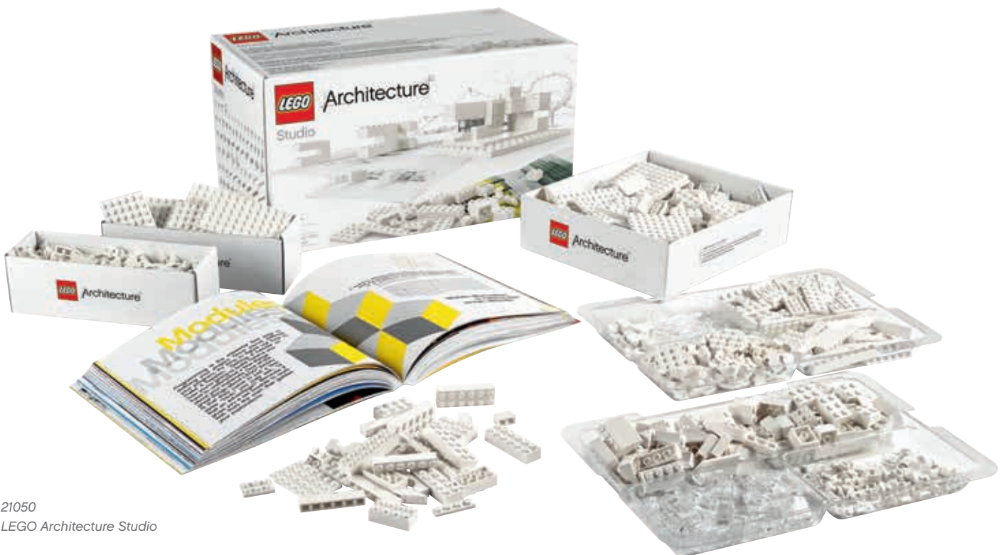
21050 LEGO Architecture Studio

The introduction of our LEGO Architecture Studio set echoes the ambitions of the earlier LEGO 'Scale Model' line and widens the potential of the LEGO Architecture series. Now you can enjoy building and learning about specific landmark buildings, or create exciting architectural models from your own fantasy. An inspiring 270-page book, featuring a number of renowned architects from around the world, guides you through the principles of architecture and encourages you in your own creative building.